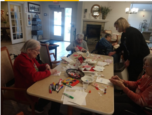
Decorating Valentine's bag fun.

We enjoyed Making crafts for the Valentine's Luncheon.